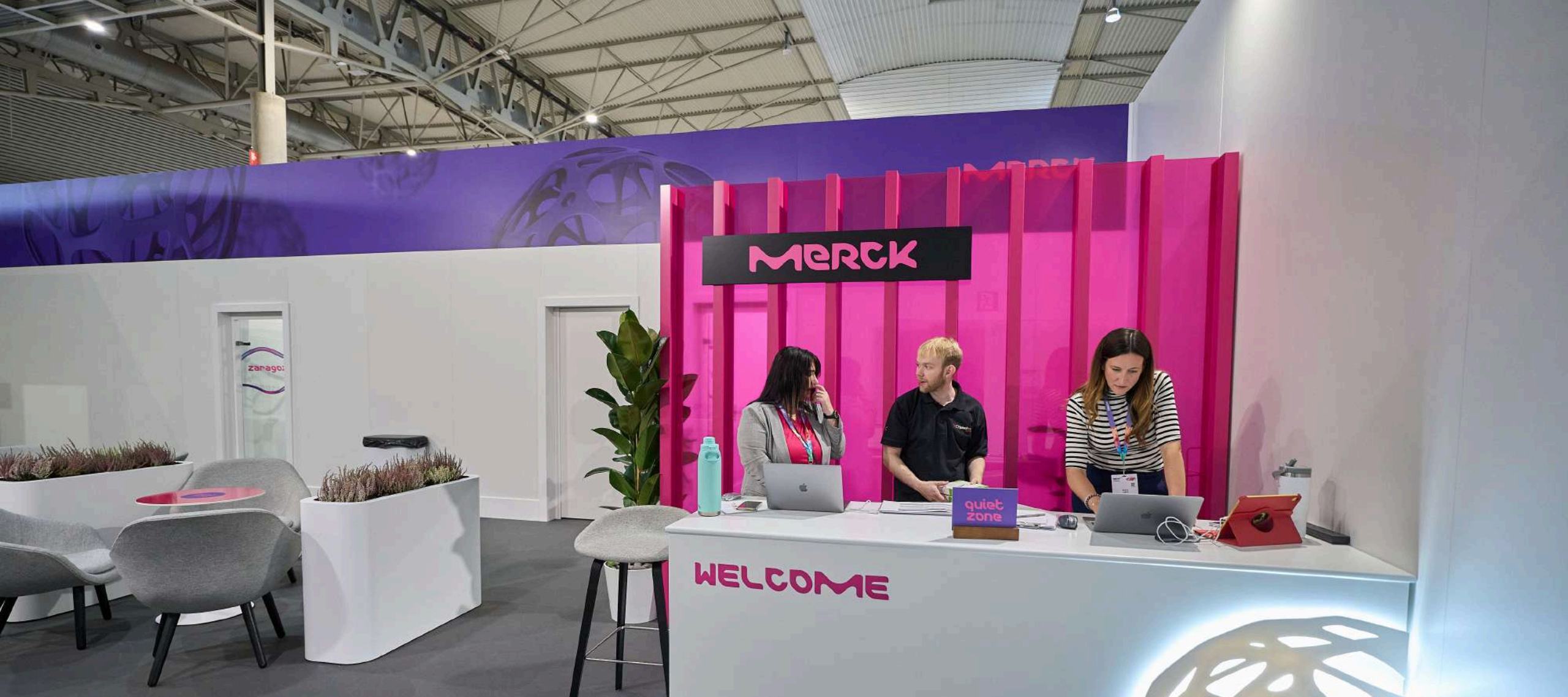
ESMO VIP BUSINESS ROOMS